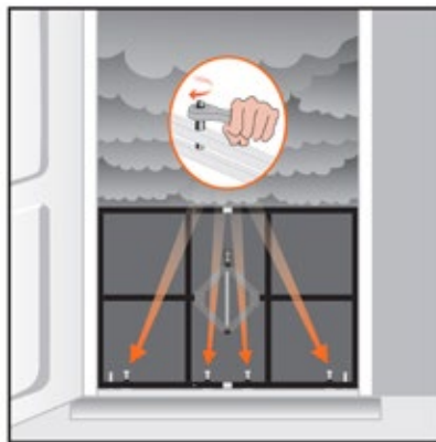
Bolt seals bottom