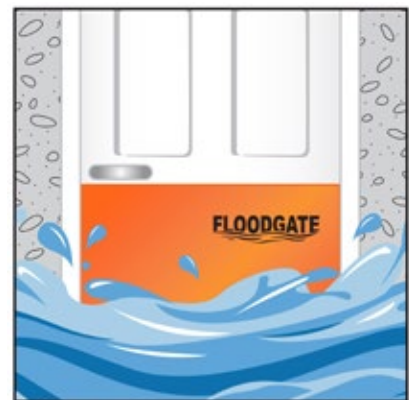
Creates water tight seal